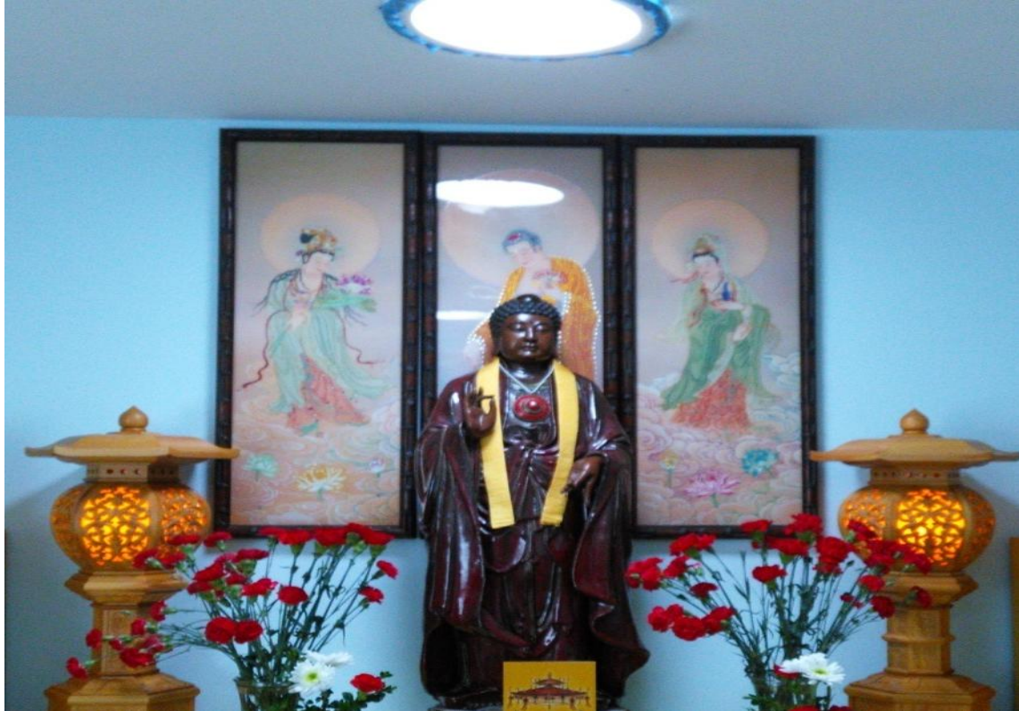
All beings possess the Buddha nature.

Members of this Buddhist community routinely assist each other in various matters including transportation and other daily needs. Voluntary language tutoring is also provided to those whose English is a second language.